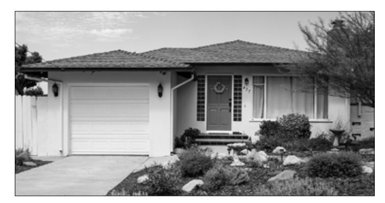
637 North Wesley Drive