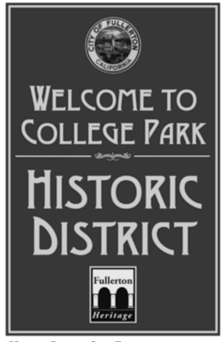
Historic District Sign Format

More than six hundred homes can be found in sixteen Historic Districts scattered around the city. Of these, 10 districts are also approved as Preservation Zones, and have been selected for sign designation. These 10 will receive signage naming their historic district. Installation of these signs should begin as early as January 2021. Signs will be approximately 12 x 18 inches.