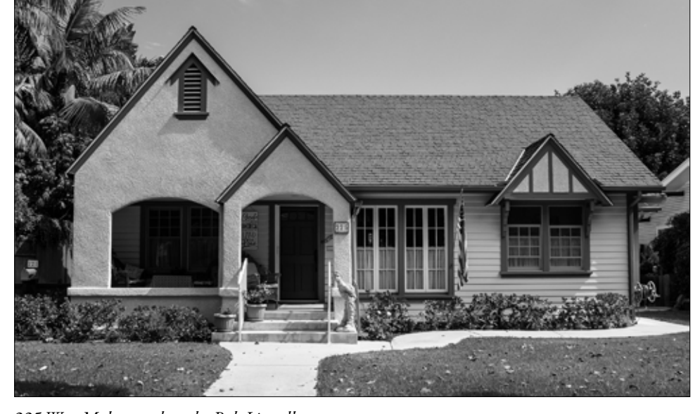
225 West Malvern